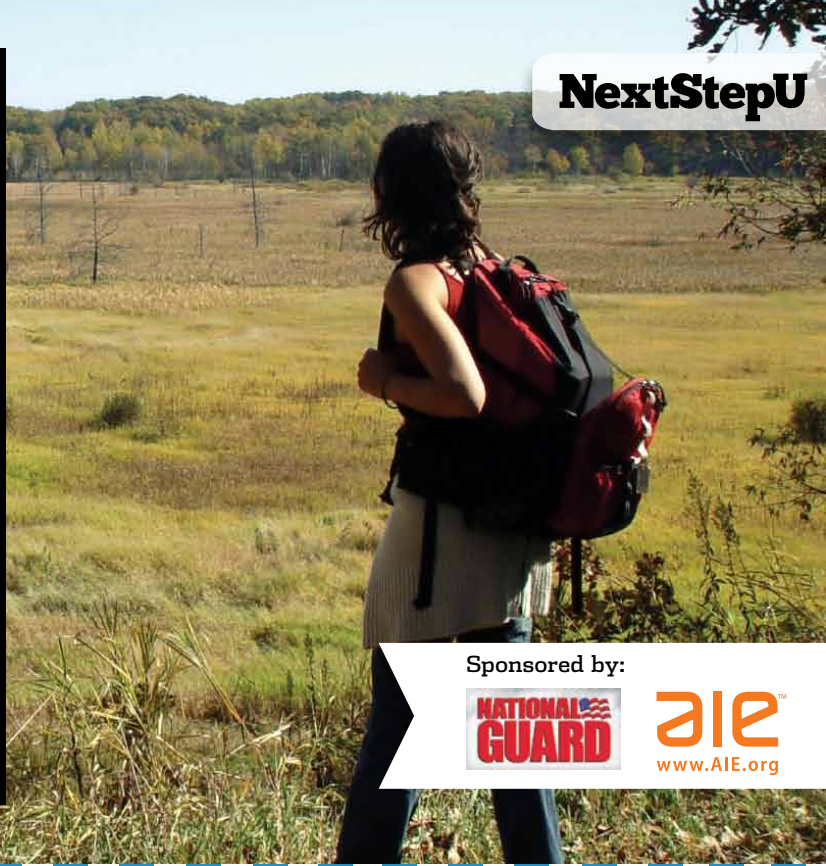
Figure out what else you need to do for college by checking out NextStepU.com/StepByStep